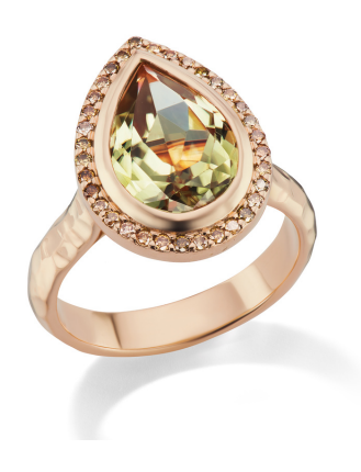
14K ROSE GOLD PEAR CUT HAMMERED CSARITE® RING This sublime pear cut CSARITE® ring is accented by magnificent chocolate diamonds.