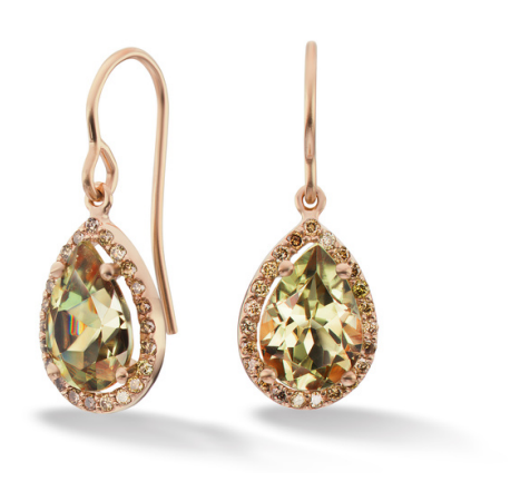
14K ROSE GOLD PEAR CUT CSARITE® DANGLE EARRINGS Magisterial CSARITE® is accented with luscious chocolate diamonds.